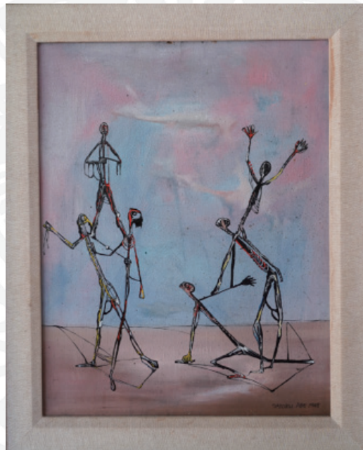
REACHING UP 1948

OIL ON CANVAS SIZE: 56"(W) x 38-1/1"(H)