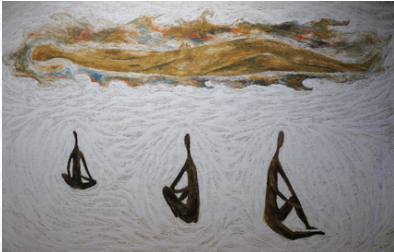
THREE MOURNERS 1955

OIL ON CANVAS SIZE: 56"(W) x 38-1/1"(H)