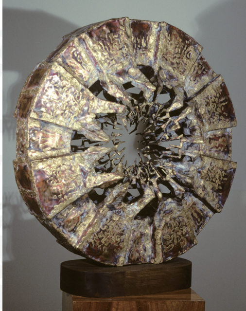
WHEEL NO 5 FROM THE WHEEL COLLECTION, STATE FOUNDATION OF CULTURE AND ARTS WELDED COPPER AND BRONZE; 1979; PHOTO CREDIT; FRANK SOJKA