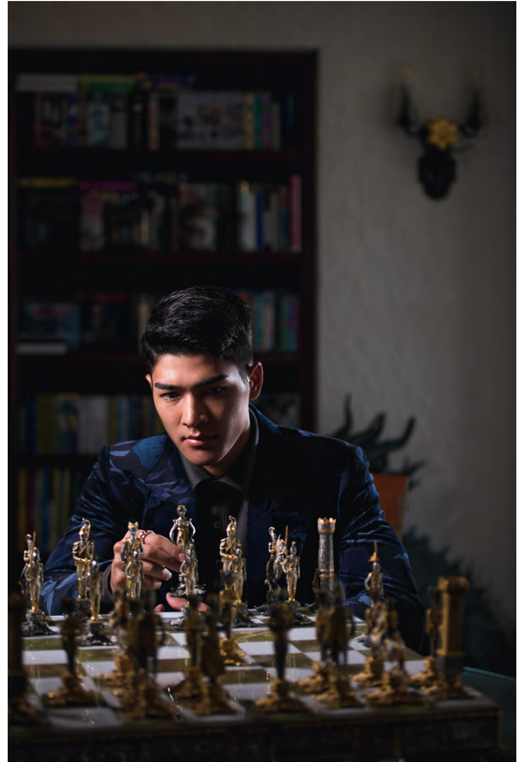
TOM FORD Jacket and sweater at NEIMAN MARCUS; TIFFANY & CO. ring.