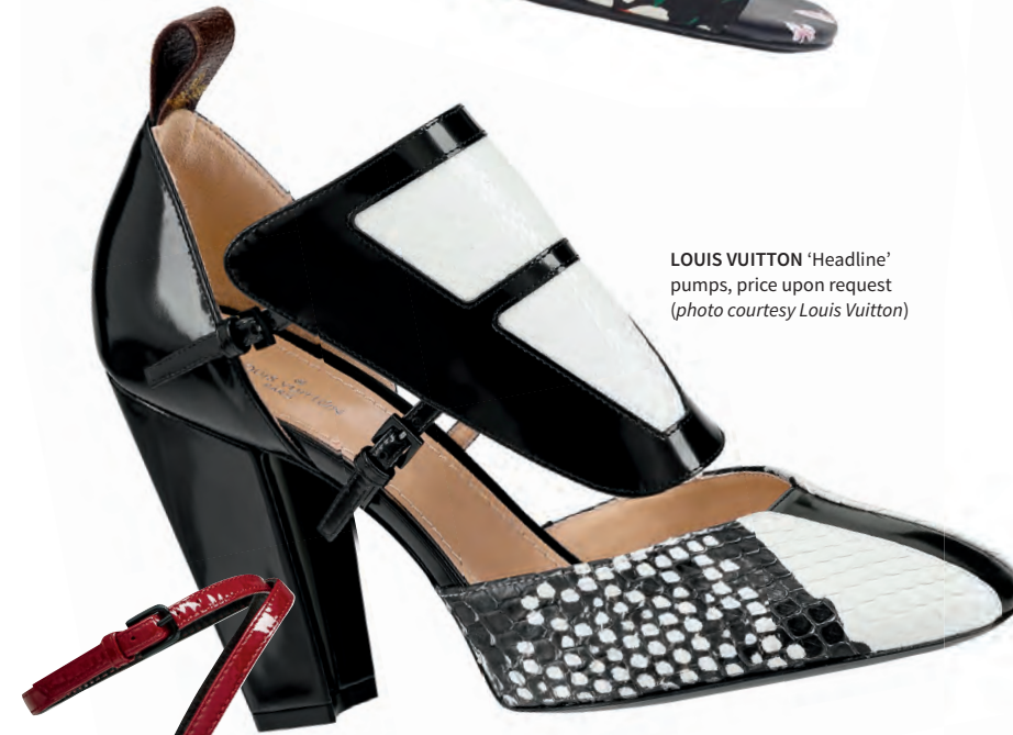
LOUIS VUITTON 'Headline' pumps, price upon request