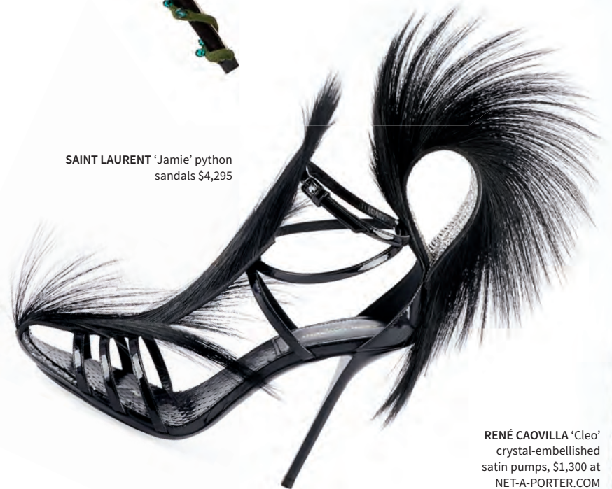
SAINT LAURENT 'Jamie' python sandals $4,295