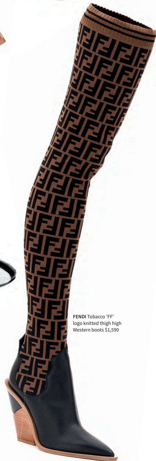
FENDI Tobacco 'FF' logo knitted thigh high Western boots $1,590