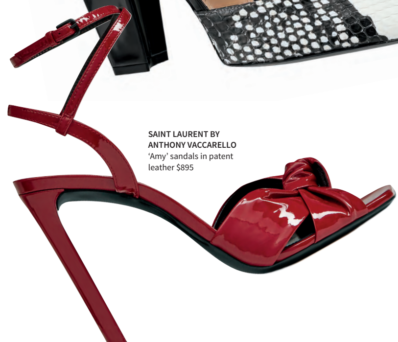
SAINT LAURENT BY ANTHONY VACCARELLO 'Amy' sandals in patent leather $895