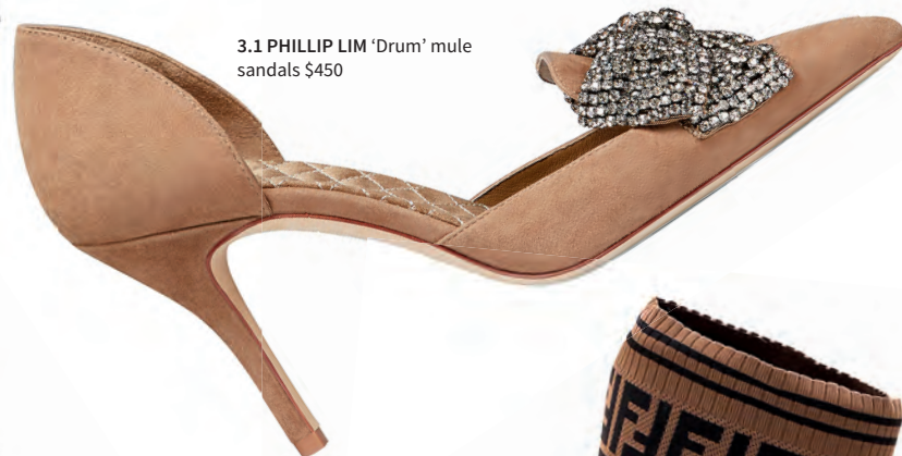
3.1 PHILLIP LIM 'Drum' mule sandals $450