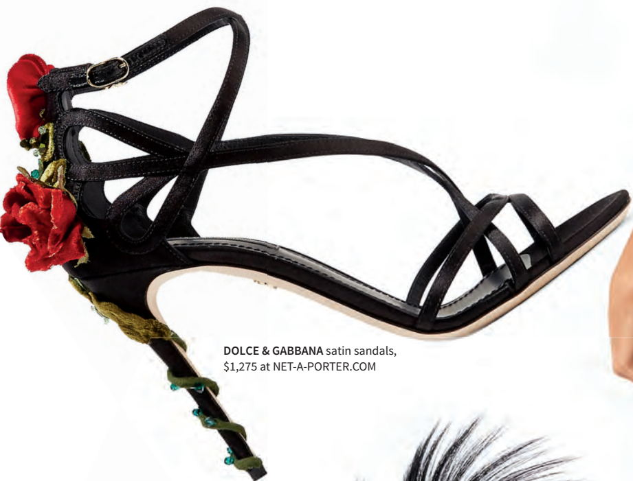
DOLCE & GABBANA satin sandals, $1,275 at NET-A-PORTER.COM