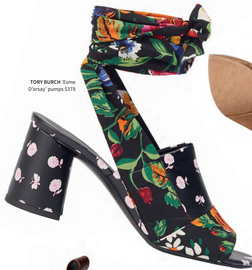
TORY BURCH 'Esme D'orsay' pumps $378